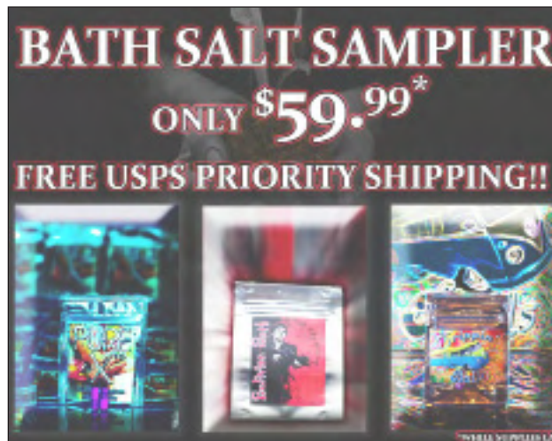
Ad for bath salt samplers, including Bolivian Bath, Pure Ivory, or Pure XTC, from the Premium Blend Herbal Web site.

Historically (dating from the 1920s) designer drugs have been opioids or hallucinogens. In fact, some designer drugs are already illegalized under the Controlled Substances Act, including MDMA (Ecstasy) and two relatives, as well as 11 versions of synthetic heroin.