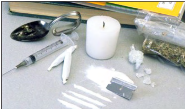
Items confiscated from a bath salt bust, where Centuria, Mo. Police arrested three men who were using bath salts mixed with meth. The mixture is known as Bliss.

Law enforcement should be familiar with the types of bath salts sold in their jurisdictions, and the effects that the drugs produce (the effects of an overdose and a common high).